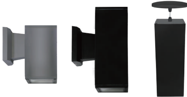
WCED-4SD (DOWN TYPE)